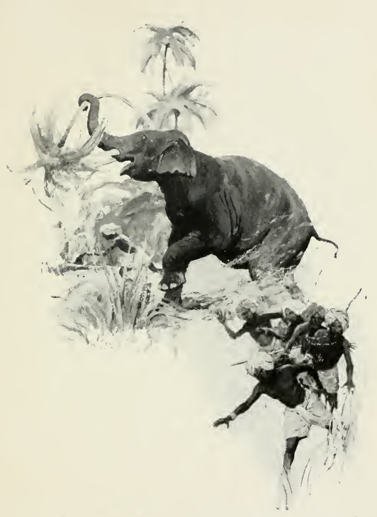
IN HIS MADNESS HE MUST HAVE GONE BACK TO THE JUNGLE