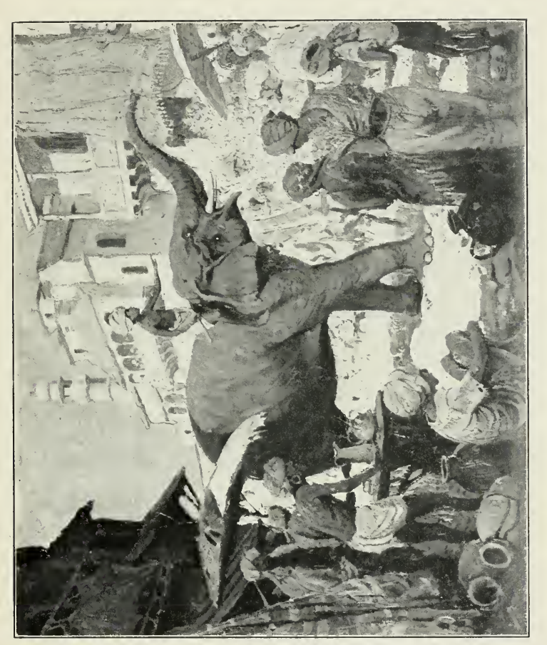
ONE DAY I TOOK THEM TO THE BAZAAR