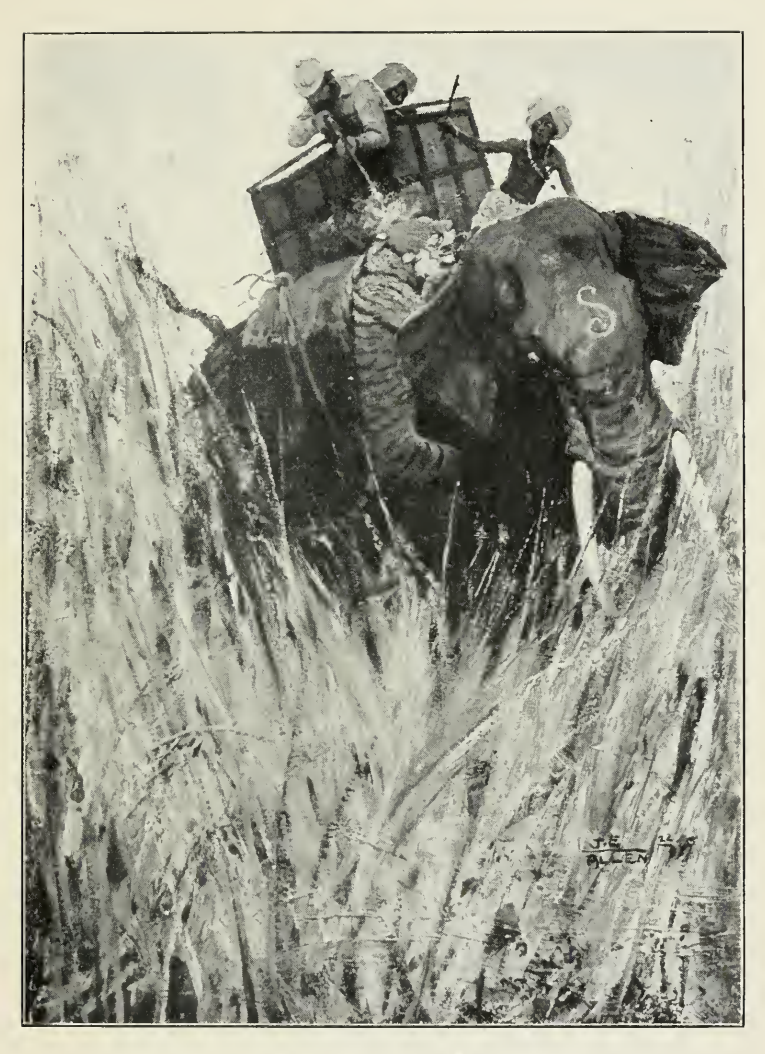
WITHOUT ANY WARNING THE MAGISTRATE FIRED