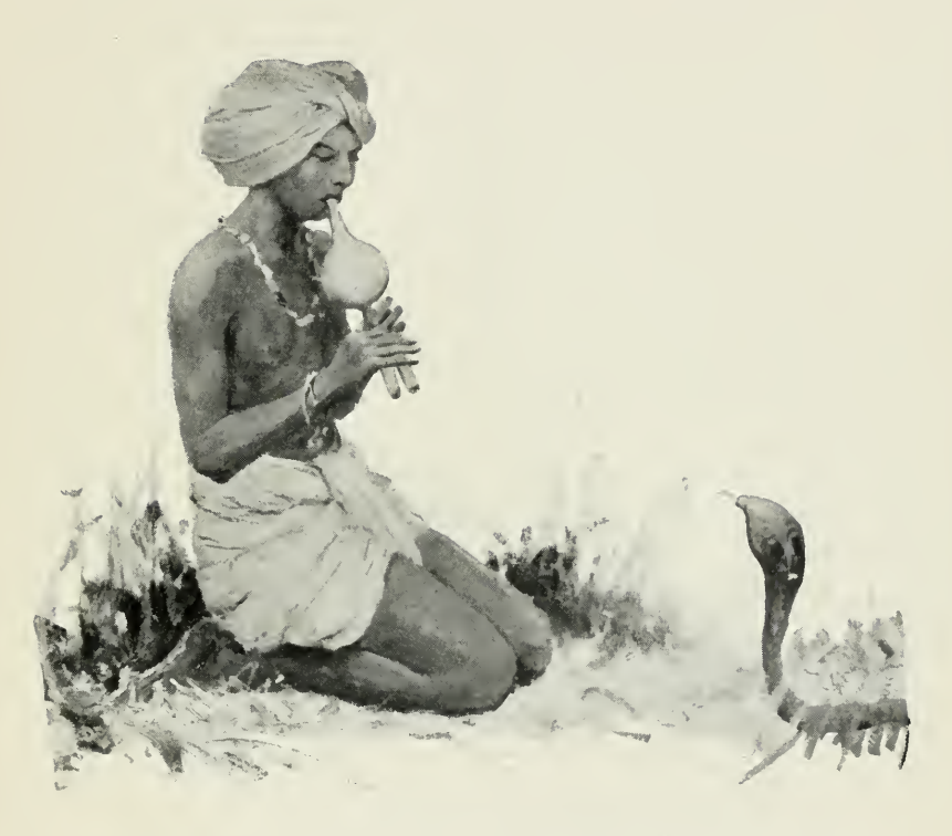
IF YOU TOOK A FLUTE AND PLAYED CERTAIN TUNES ON IT, ALL OF THE SNAKES WOULD COME OUT OF THEIR HOLES AND DANCE TO THE MUSIC