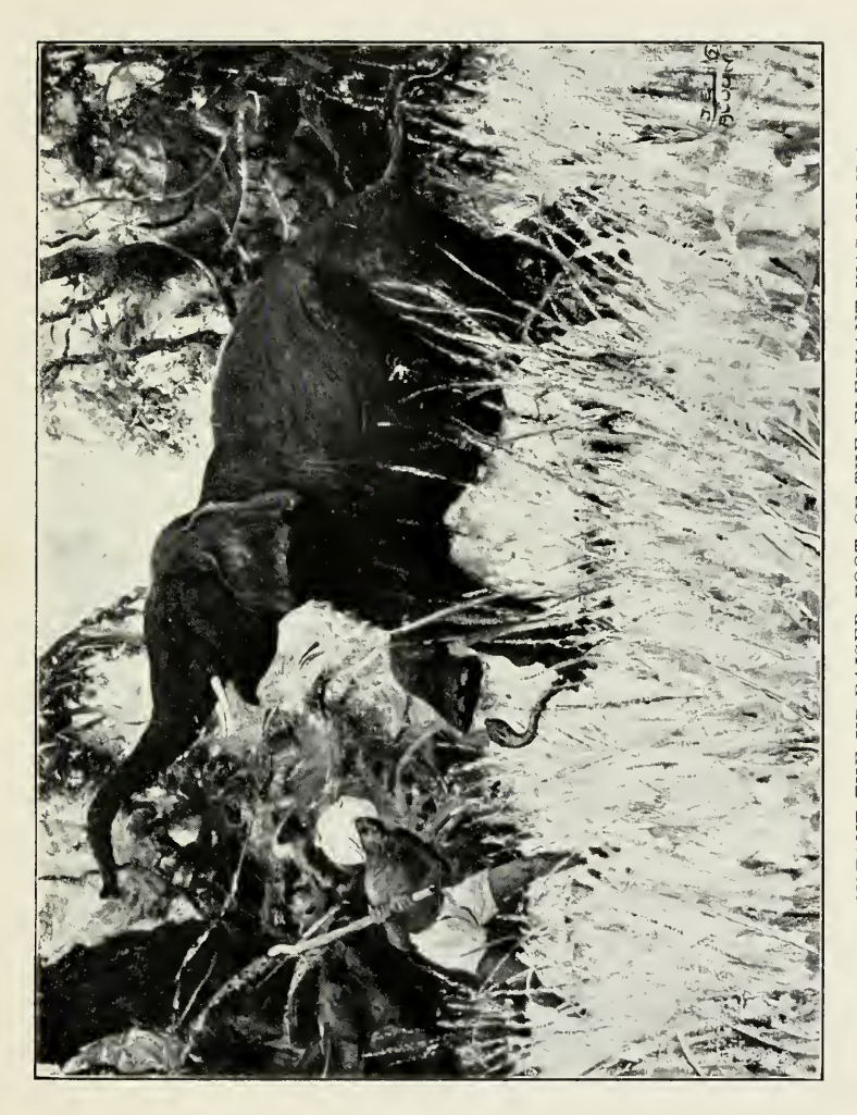
THAT VERY INSTANT THE UP-RAISED FOOT OF THE ELEPHANT WAS ON HIS HEAD