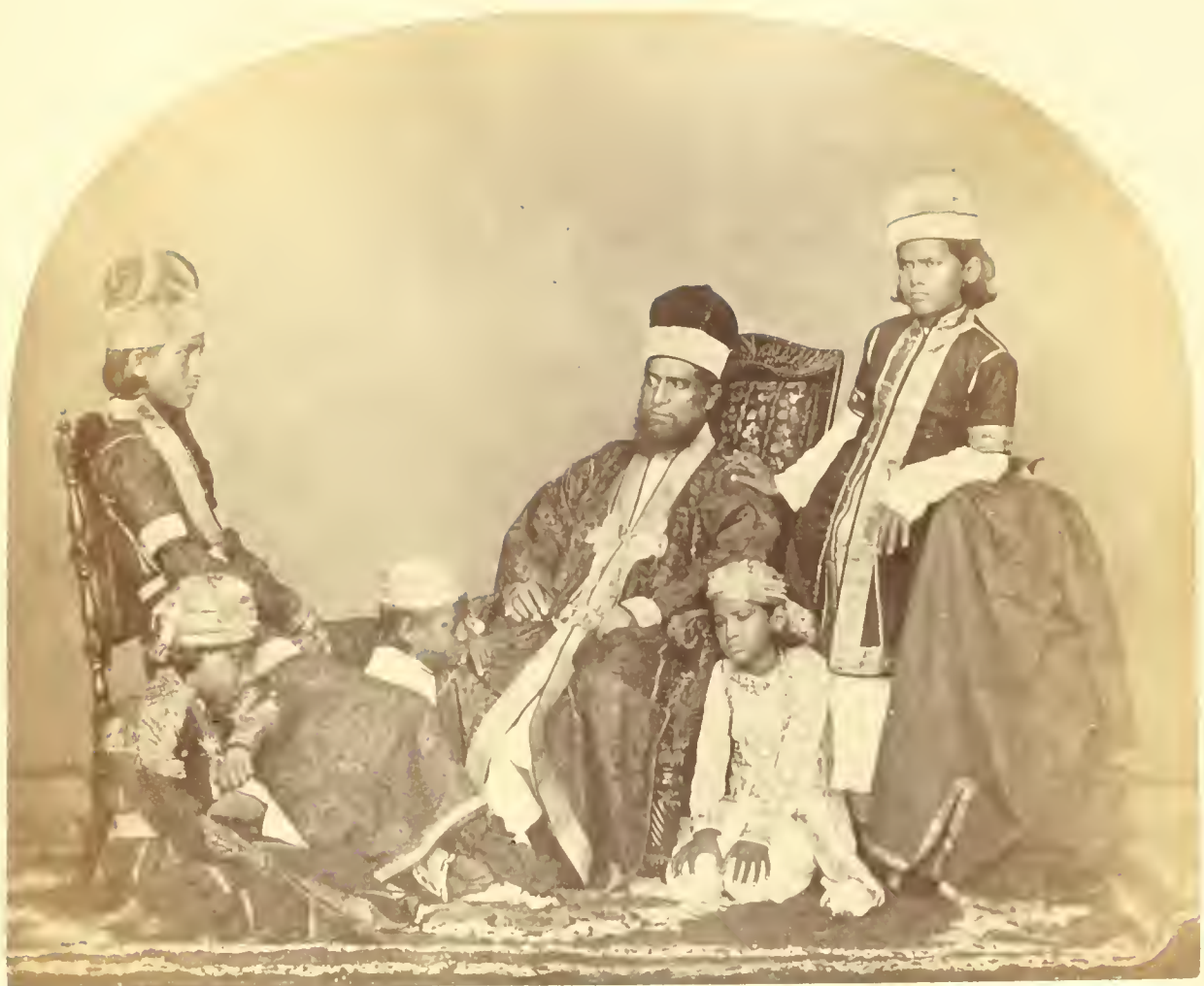
MOGHULS. MUSSULMANS, OF ROYAL FAMILY OF DELHI. DELHI. (197)