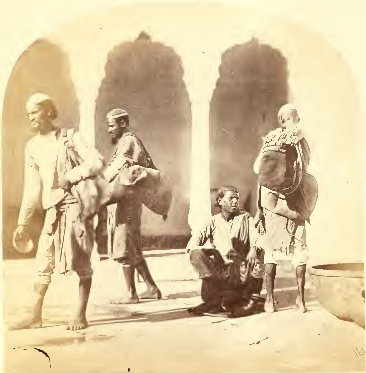
BHEESTIES. MUSSULMANS. DELHI. (189)