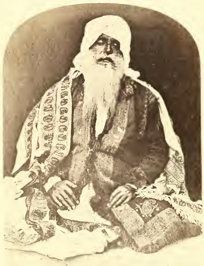
A SODHEE. SIKH. DESCENDANT OF GOVIND. TRANS-SUTLEJ STATES.