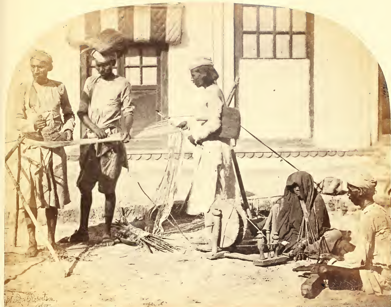
WEAVERS. HINDOOS. DELHI. (191)