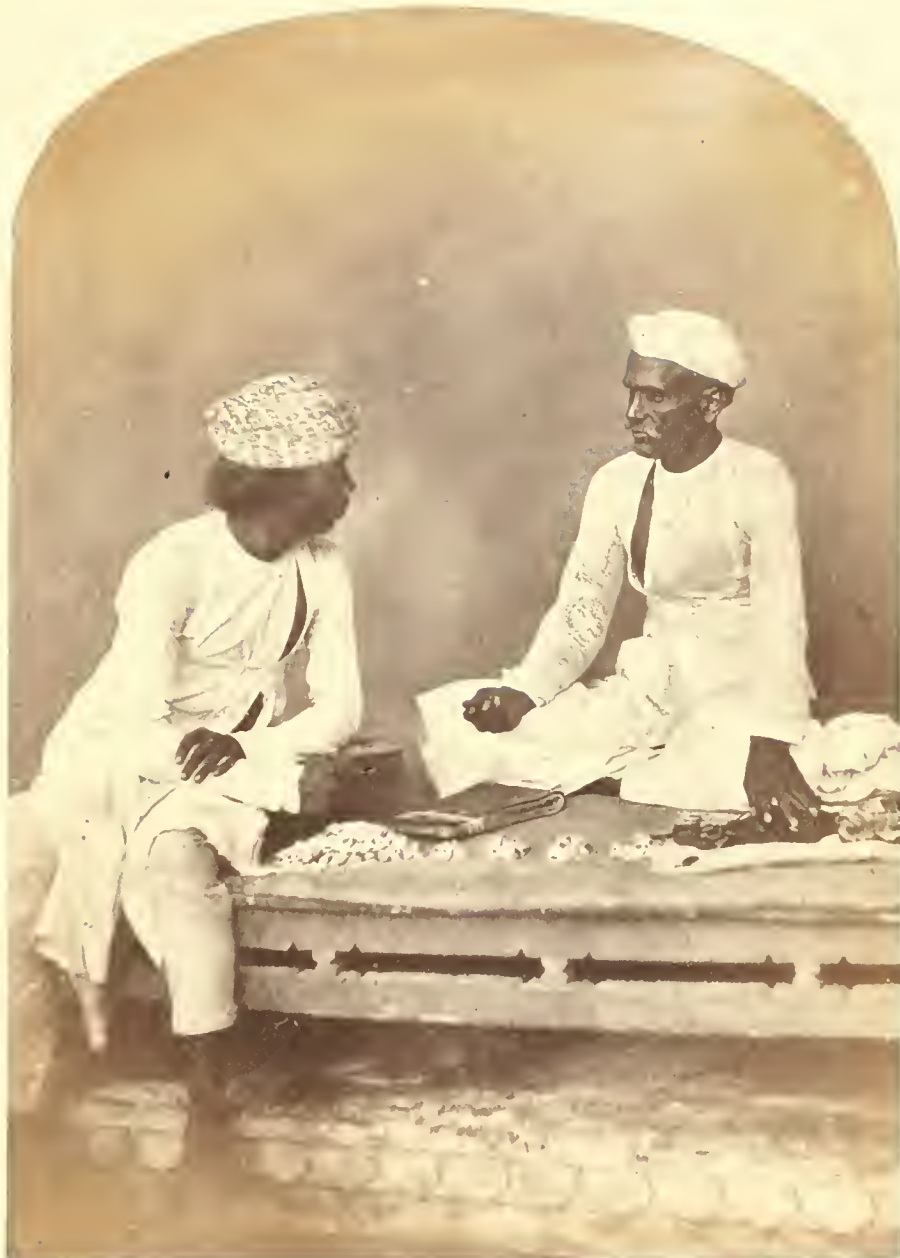
SHROFF. MONEY DEALER. HINDOO. DELHI. (185)