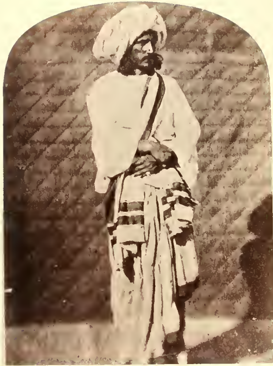
ZEMINDAR. DAGAR TRIBE. MAHOMEDAN. FEROZEPORE.