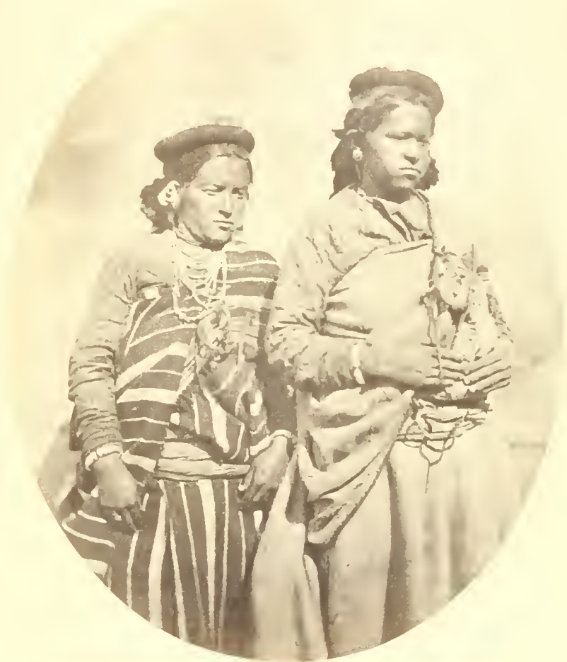
KUNYT WOMEN. HINDOO AND BUDDHIST. SIMLA. (213)