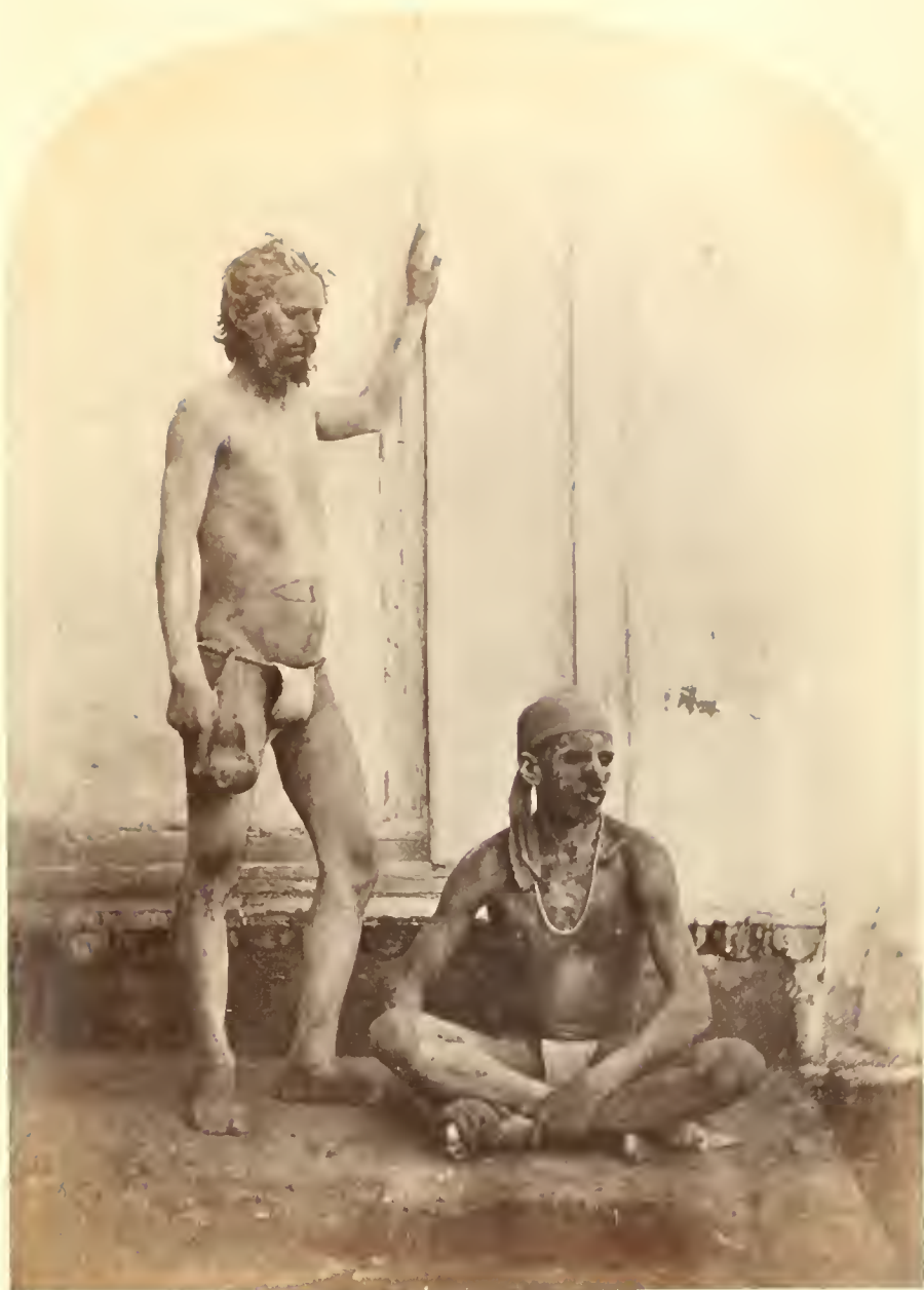
OODASSEES. SIKH DEVOTEES. MENDICANTS. DELHI.