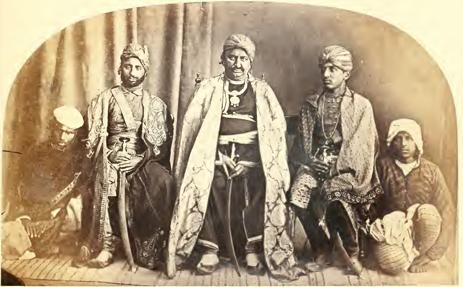
RAJAH OF KOTHEE. HINDOO OF RAJPOOT ORIGIN.