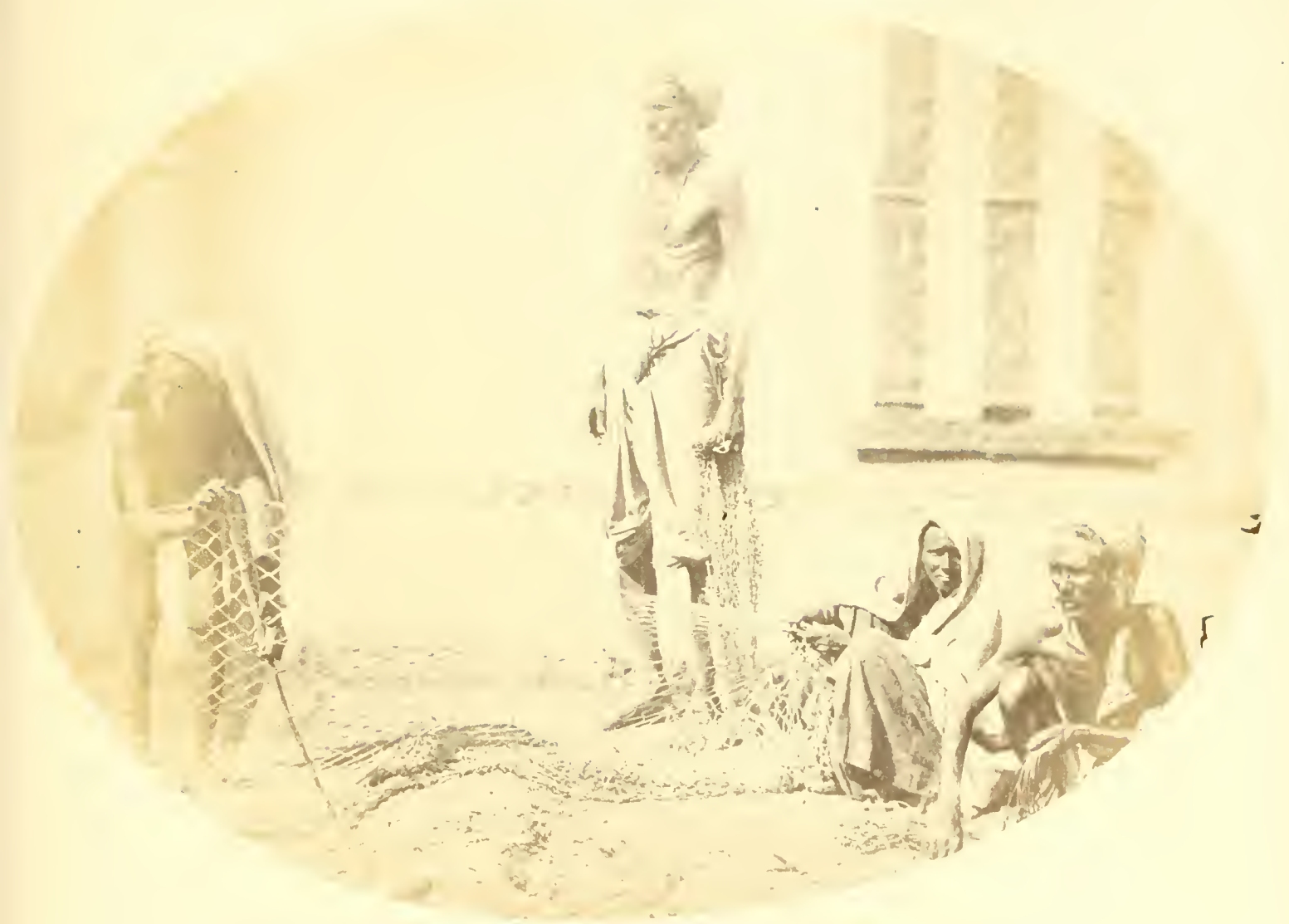
BAORIES. BIRD CATCHERS. LOW CASTE HINDOOS. DELHI. (190)