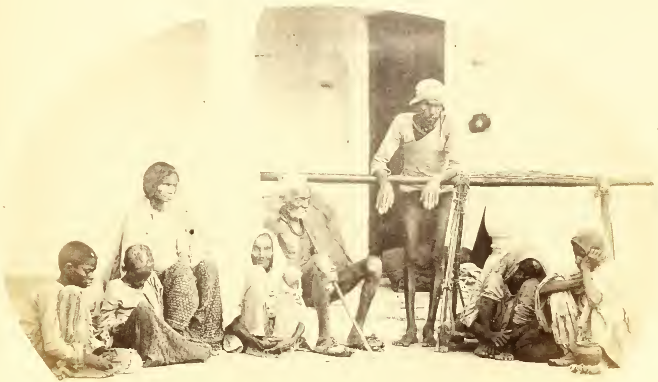
FAMINE STRICKEN GROUP.