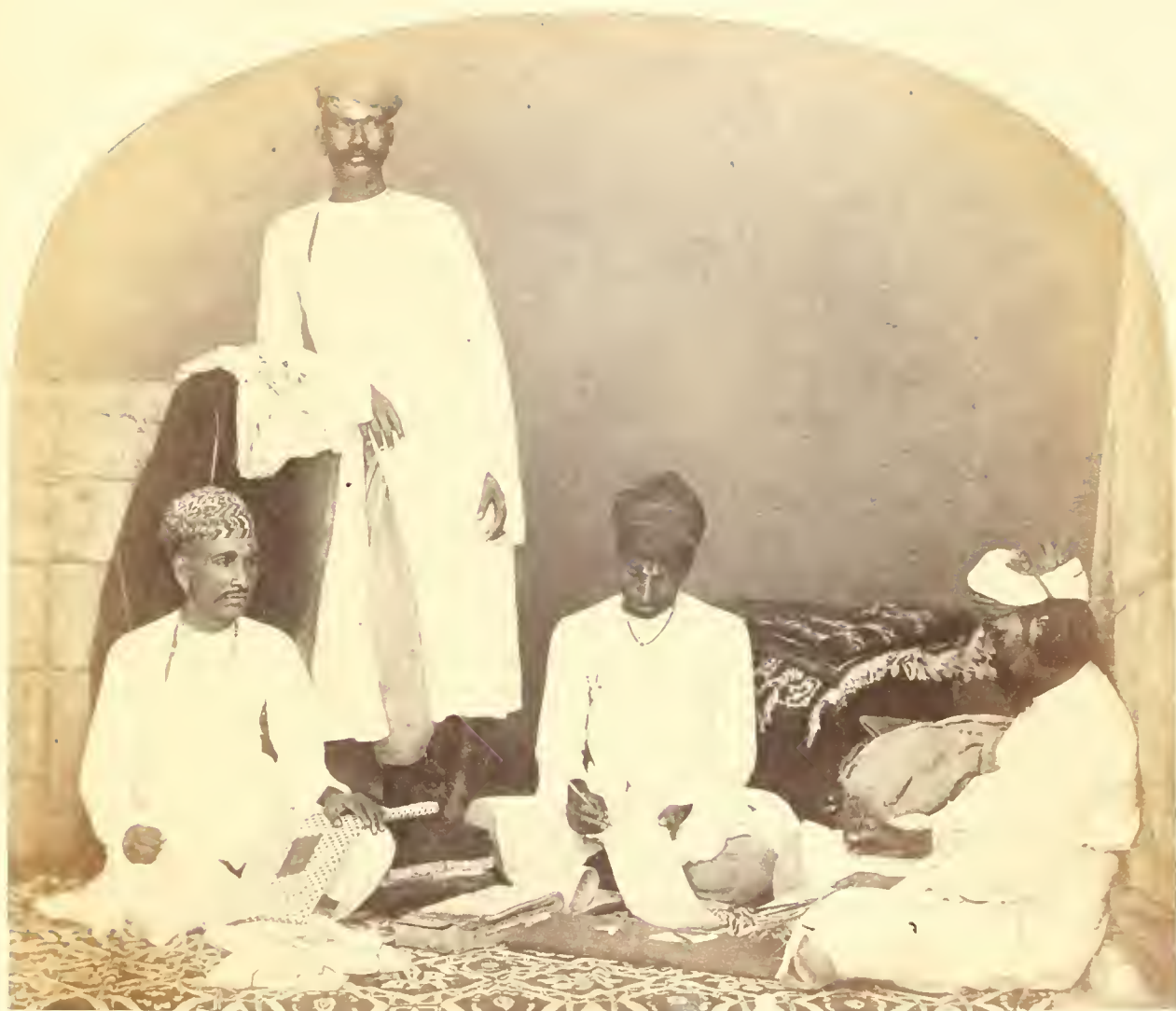
MARWARREES. HINDOO MERCHANTS, ORIGINALLY FROM MARWAR. DELHI. (201)