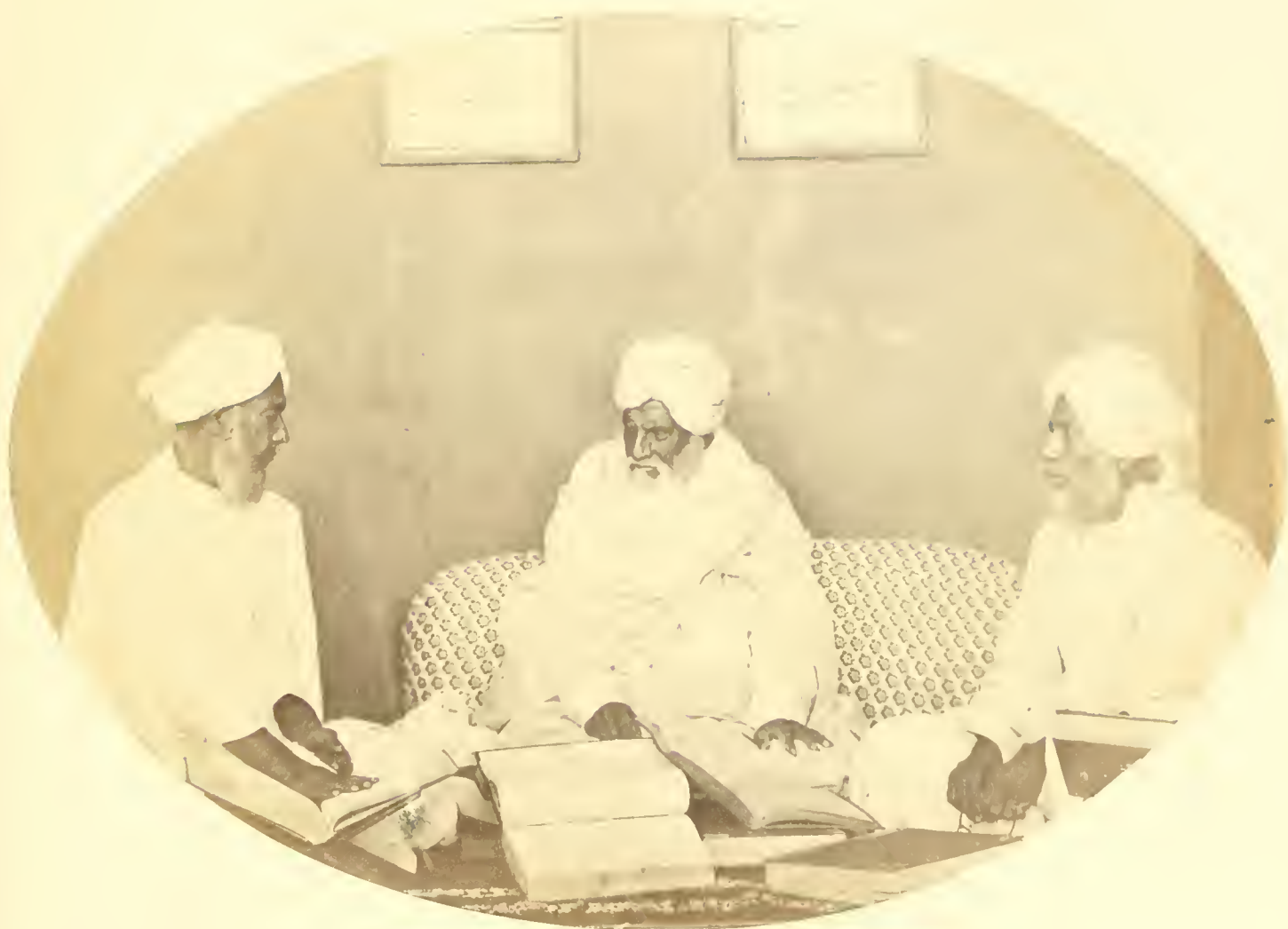
MOULVEES. MUSSULMAN LAWYERS. DELHI. (198)