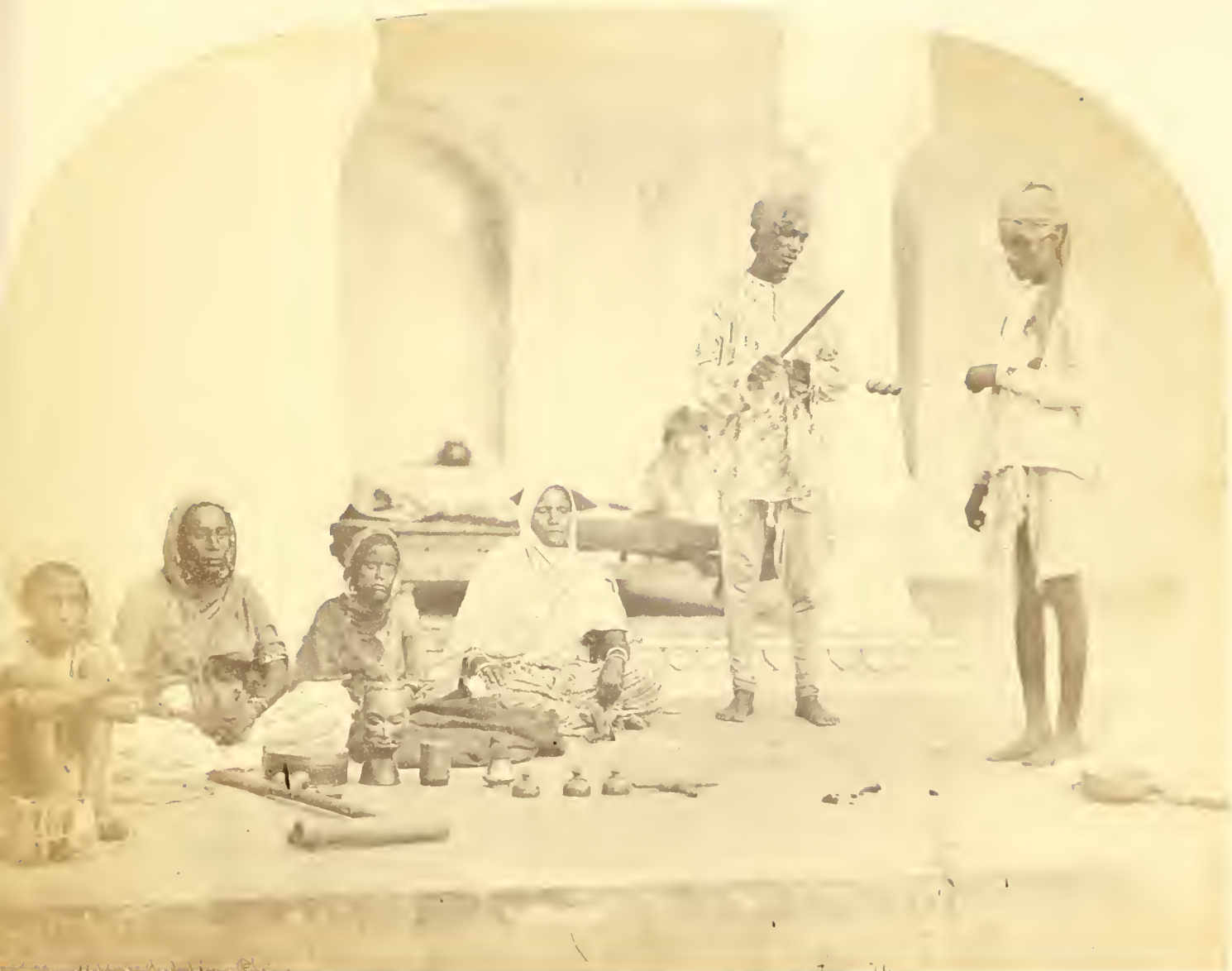
NUTS. JUGGLERS AND ACROBATS. LOW CASTE HINDOOS. DELHI. (194)