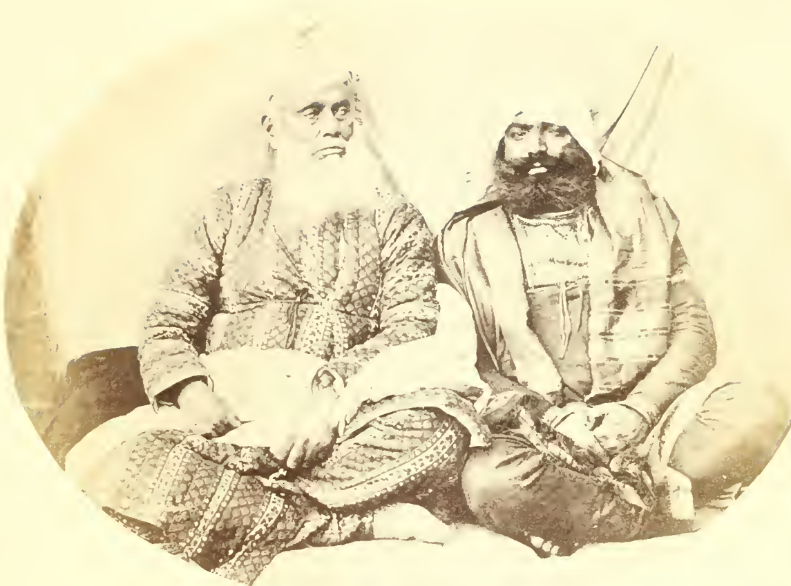
SHEIKHS. MUSSULMANS. FORMERLY HINDOOS. TRANS-SUTLEJ STATES.