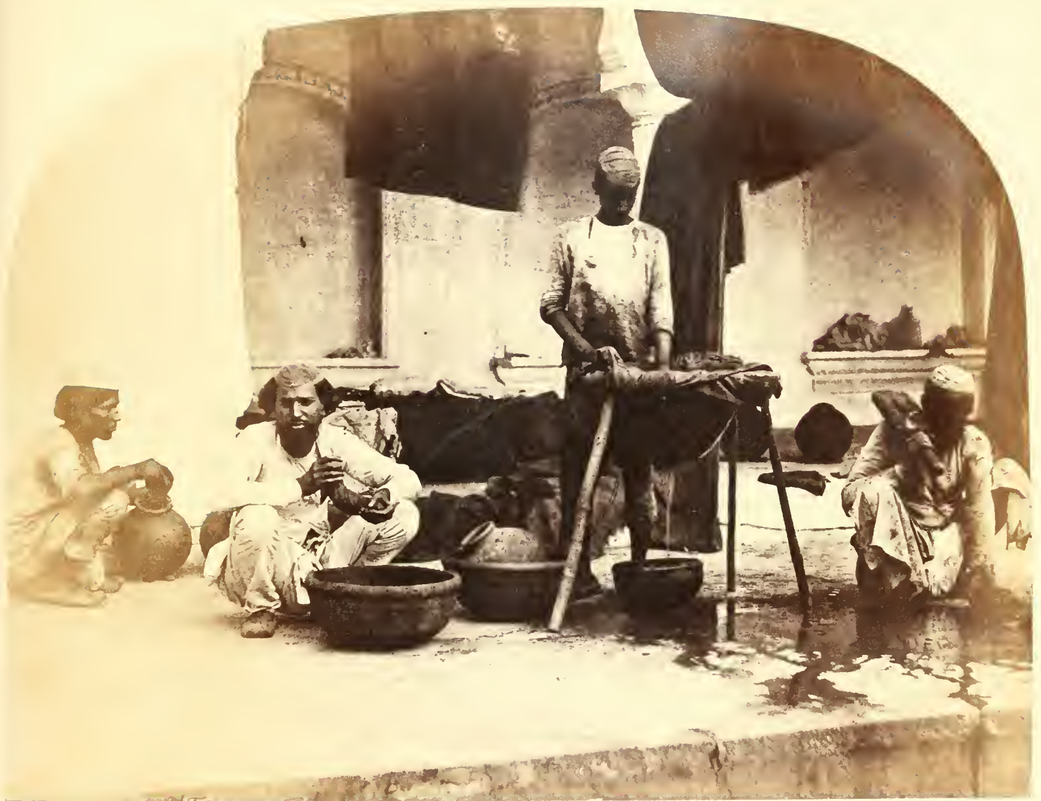
DYERS. MAHOMEDANS. DELHI. (183)