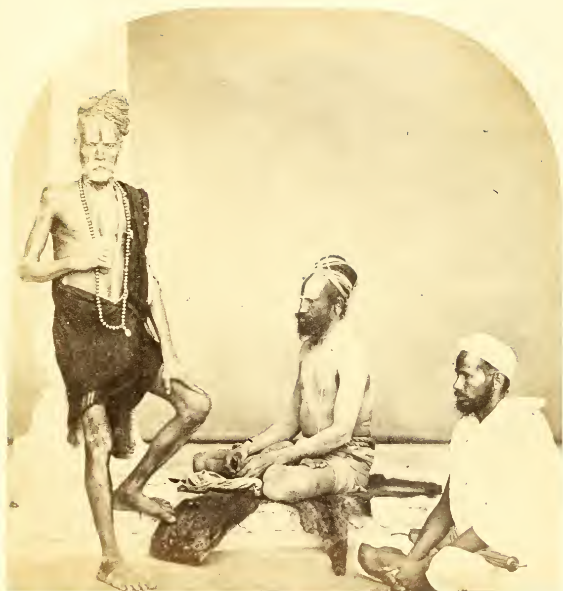
BAIRAGEES. HINDOO DEVOTEES. DELHI. (203)