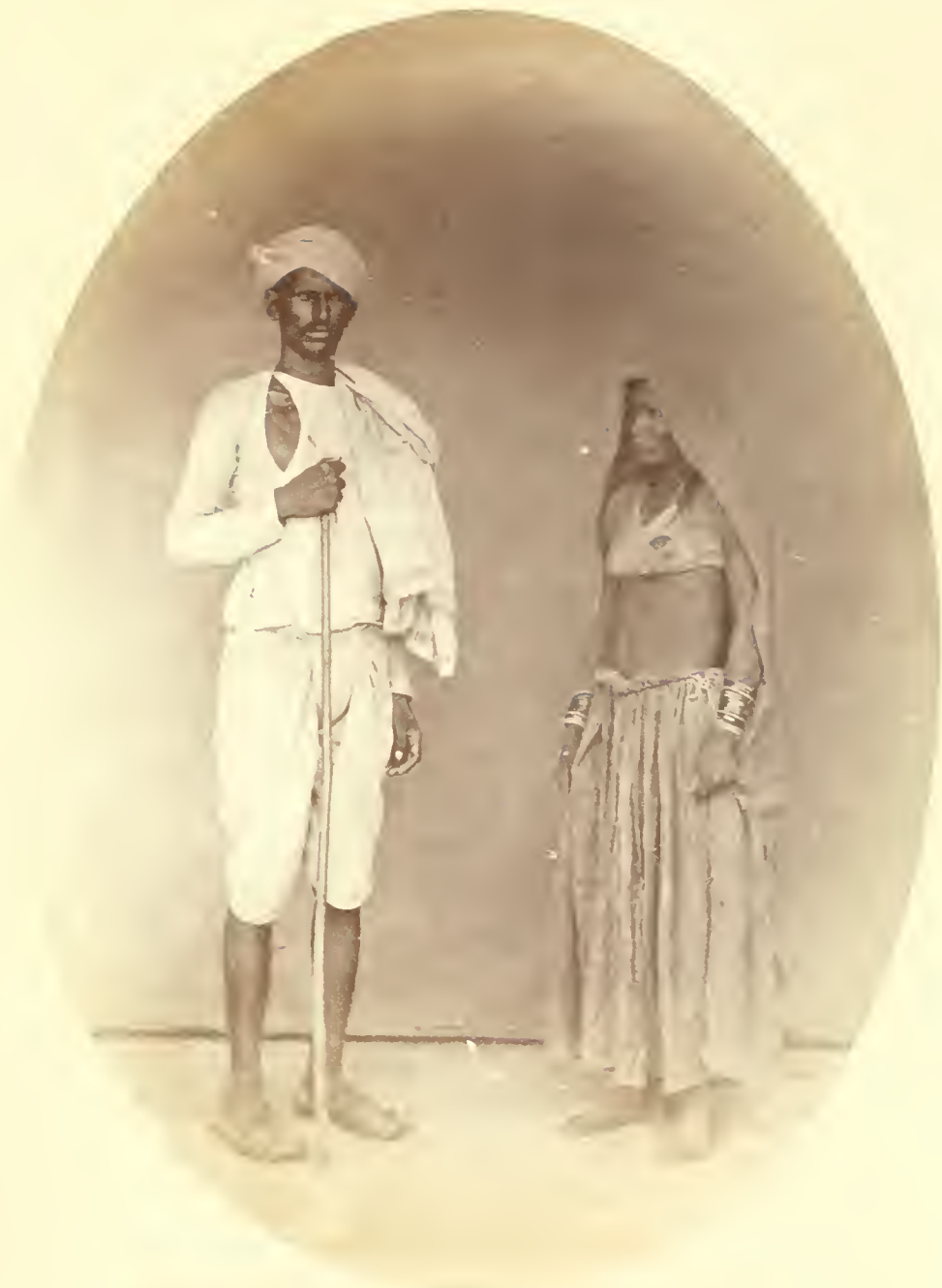
MEENAS. HINDOOS OF LOW CASTE. VAGRANTS. DELHI. (204)