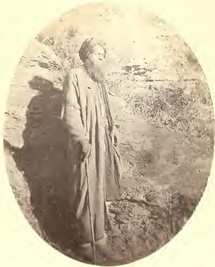
CASHMIRI. FROM CASHMERE. MUSSULMAN. SIMLA. (215)