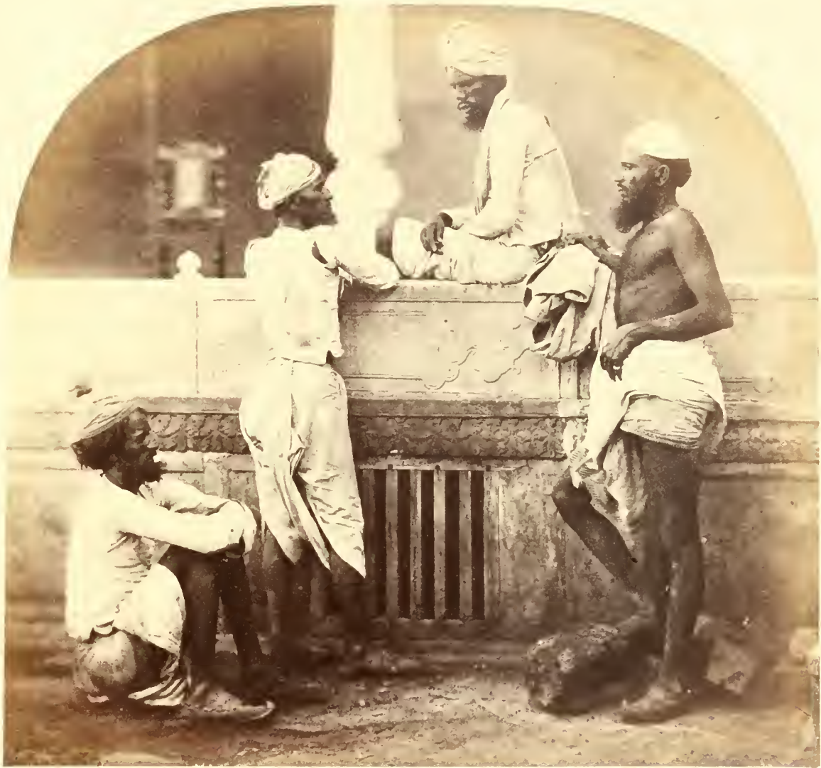
MEWATTEES. MUSSULMANS. ORIGINALLY HINDOOS. DELHI. (202)