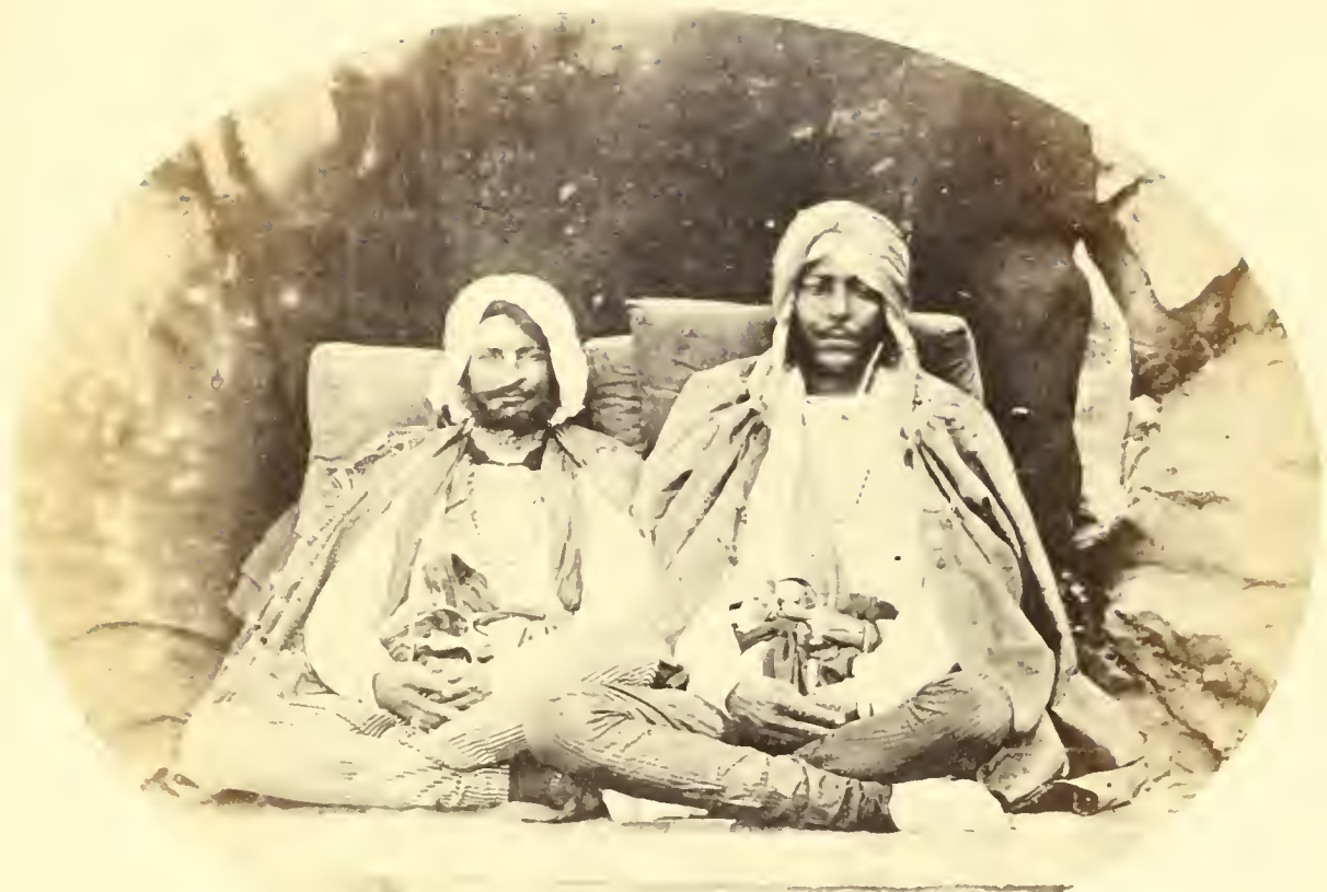
RAJPOOTS. KUTOCH AND PUTHANEEA. HINDOOS. TRANS-SUTLEJ STATES.