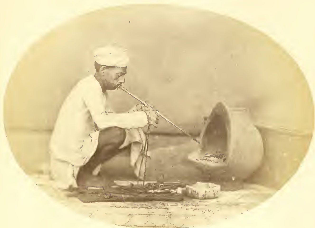
SONAR. GOLDSMITH. HINDOO. DELHI. (186)