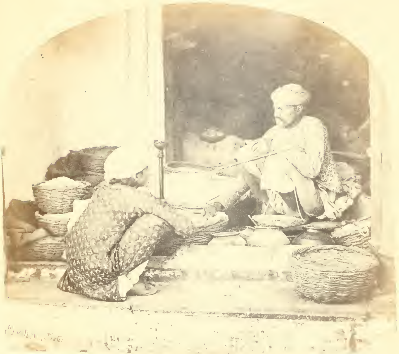
BUNNEA. HINDOO TRADESMAN. DELHI. (184)