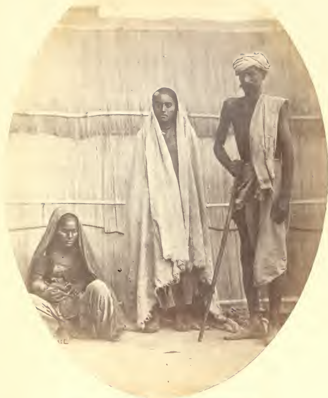
SANSEES. VAGRANTS, OF NO PARTICULAR CREED. DELHI. (195)