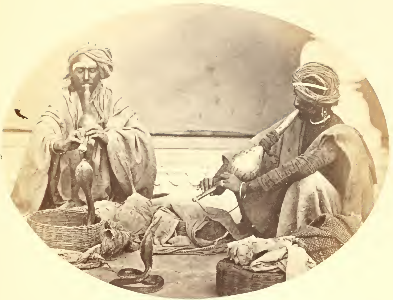
JOGIS. SNAKE CHARMERS. HINDOOS OF LOW CASTE. DELHI. (205)