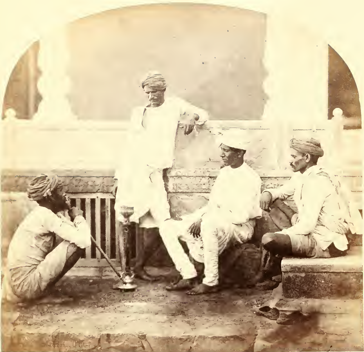
JATS. HINDOOS. DELHI. (192)