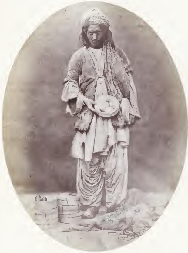
AFGHAN FRUIT SELLER. SOONNEE MUSSULMAN. SIND. 333.