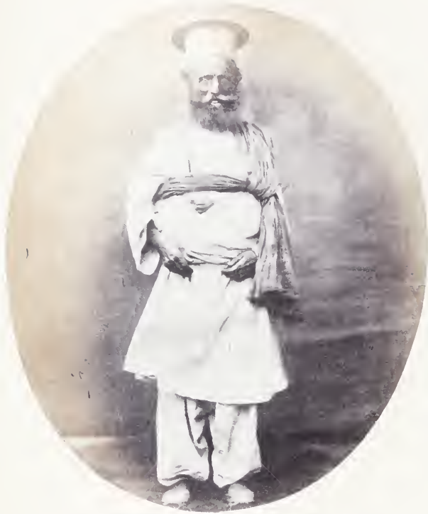
A BOORGAREE. BELOCH. SOONNEE MUSSULMAN. SIND. 297.