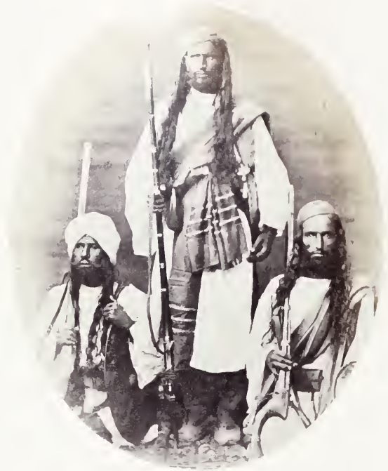
BRAHOOEES. INHABITANTS OF KHELAT STATE. SOONNEE MAHOMEDANS. SIND. 321.