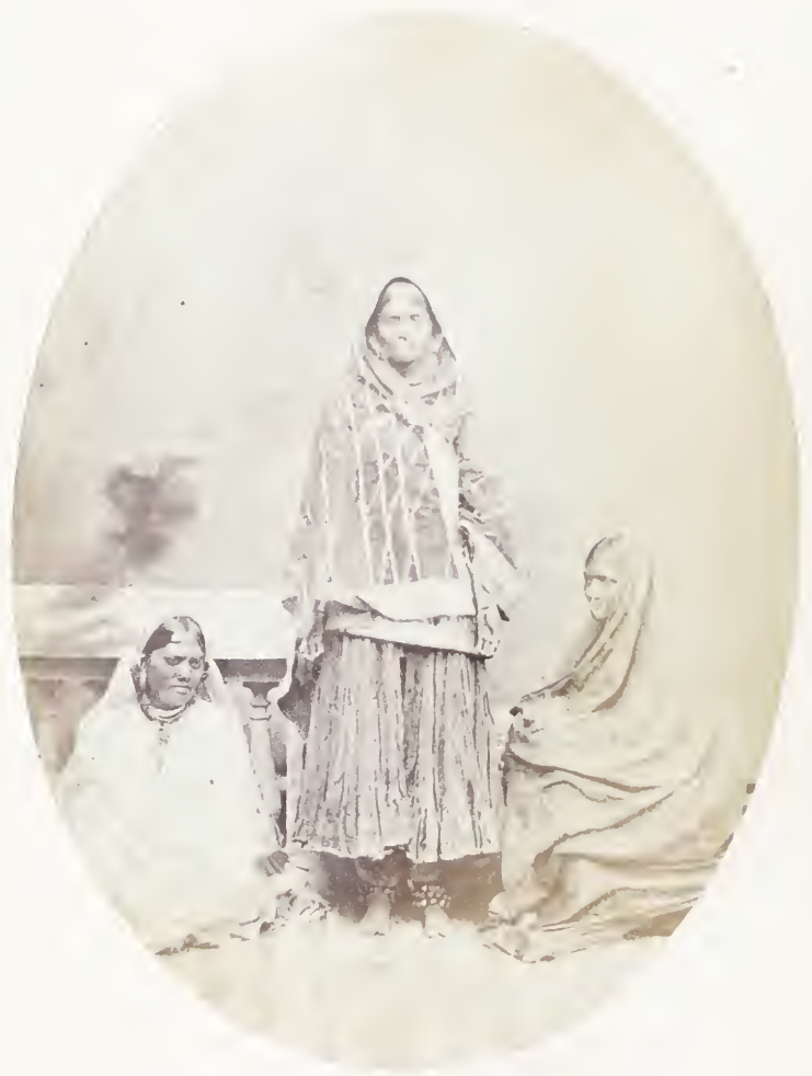
MOHANA WOMEN SOONNEE MUSSULMANS. SIND. 338.