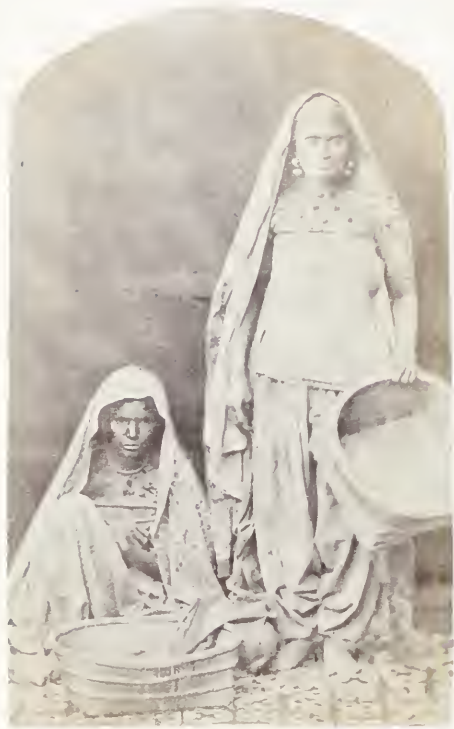
SELLERS OF FISH. MUSSULMANS. SIND. 339.