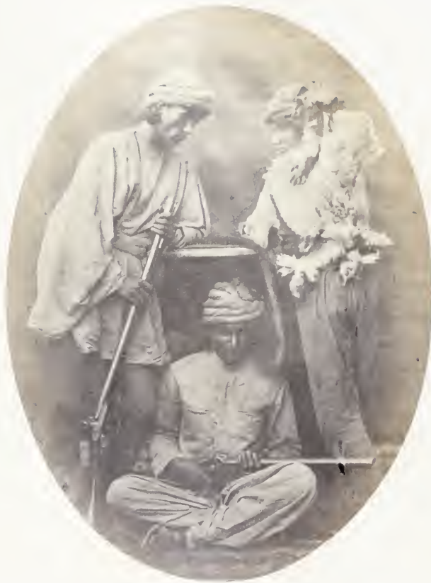
DAPHERS OR SHIKAREES HUNTSMEN AND SCAVENGERS. MUSSULMANS. SIND. 326.