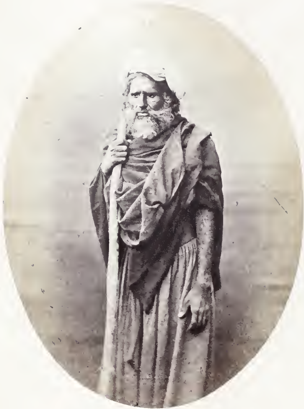
M H A R. DESERT TRIBE NEAR BHAWULPOOR. SOONNEE MUSSULMAN. S I N D. 317.