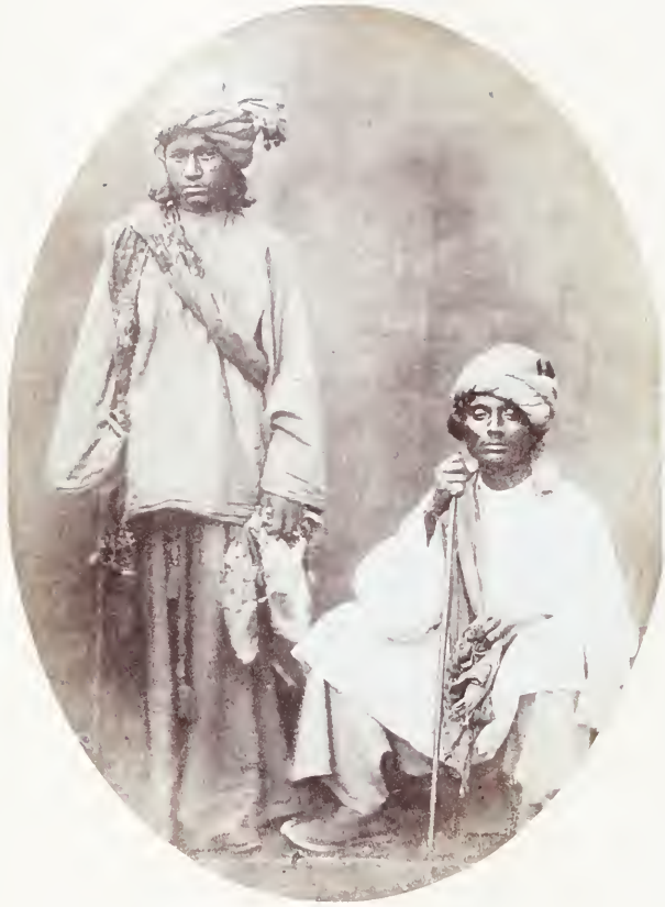
TWO SINDEES. SOONNEE MUSSULMANS. SIND. 318.