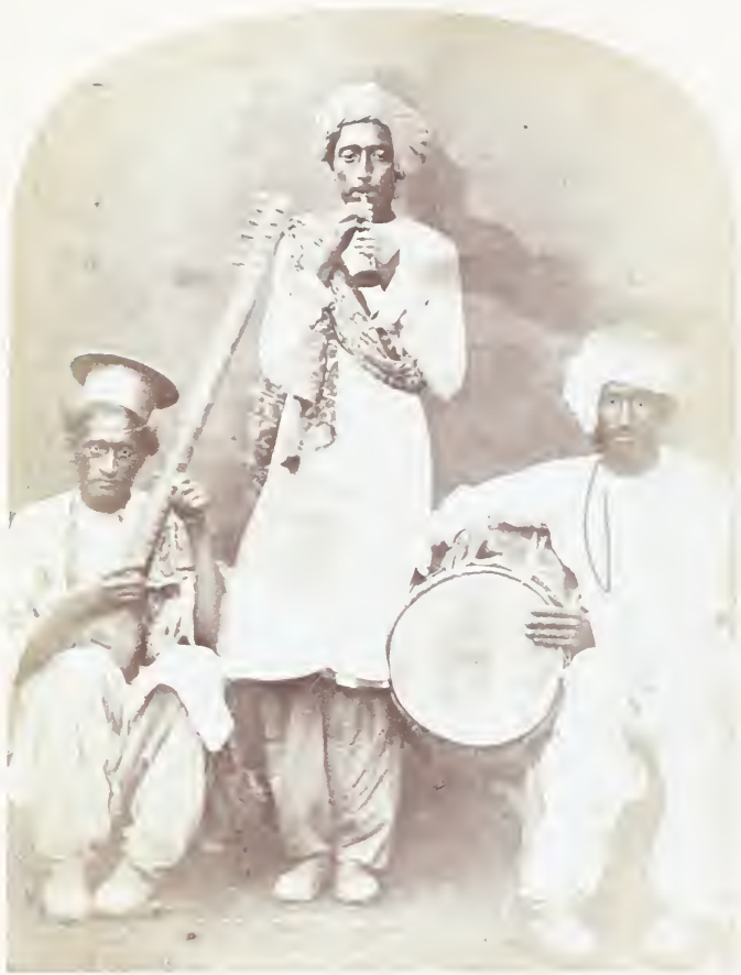
MINSTRELS. SOONNEE MUSSULMANS. SIND. (335-2)