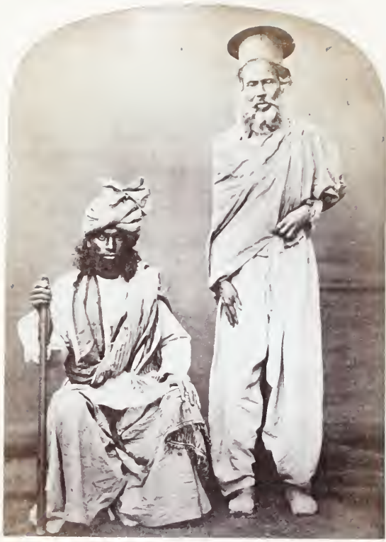
A SINDEE AND BELOCHEE. MUSSULMANS. SIND. S11.