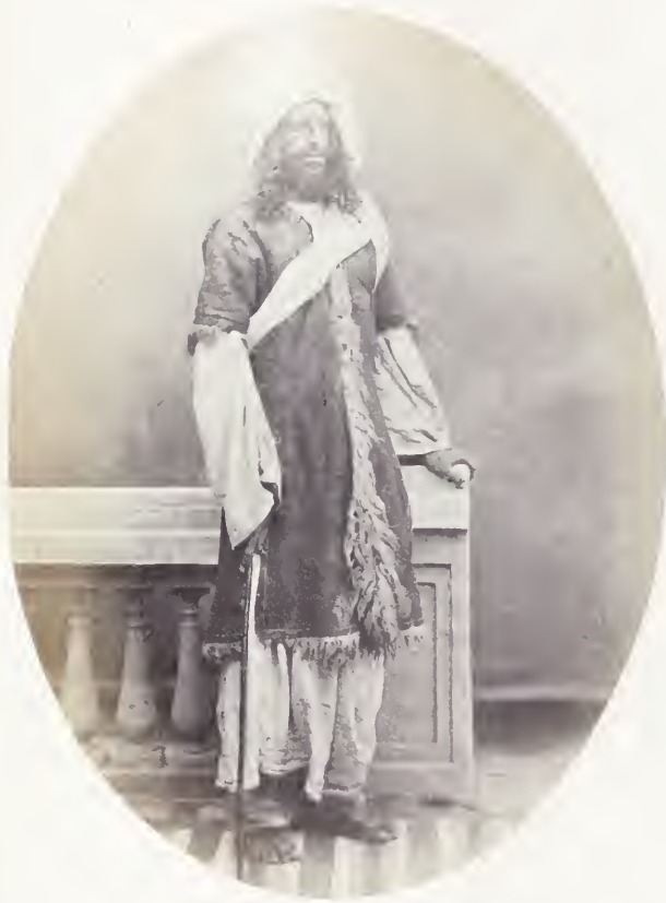
A JUTT. BELOCH TRIBE SOONNEE MUSSULMAN. SIND. 310.