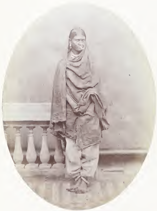
MOHANA WOMAN. SOONNEE MUSSULMAN. SIND. 338-2.