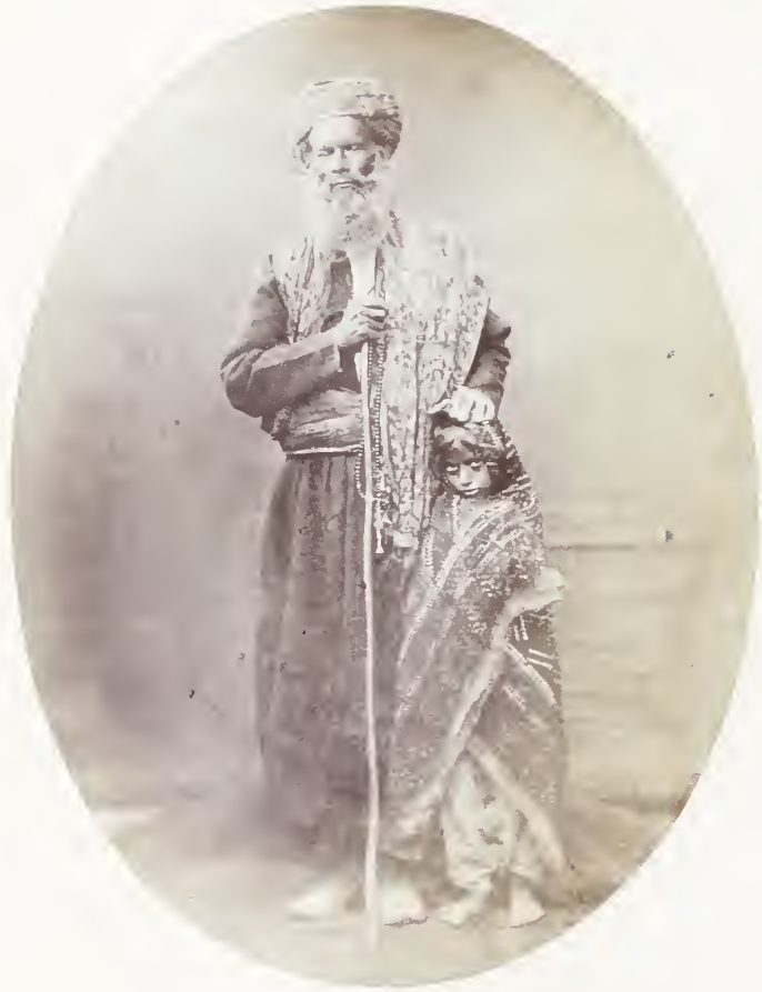
A NOOMRYA AND HIS DAUGHTER. SOONNEE MUSSULMANS. SIND.