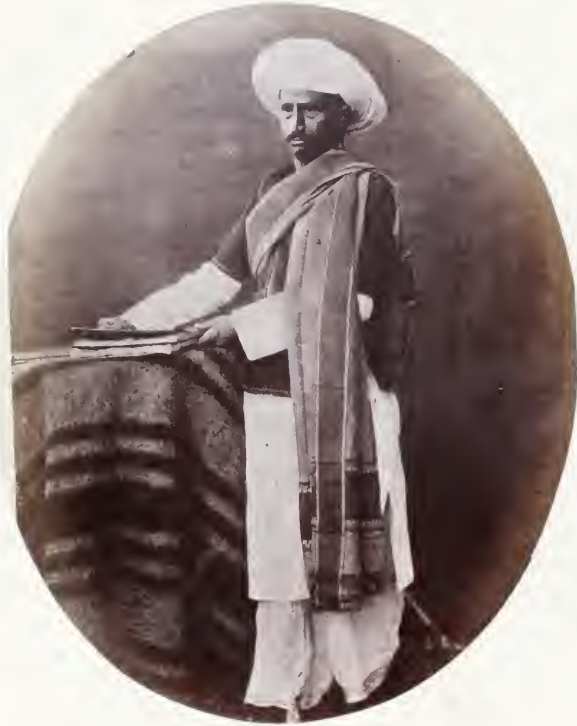
SHROFF OR NATIVE BANKER. HINDOO. SIND. 350.