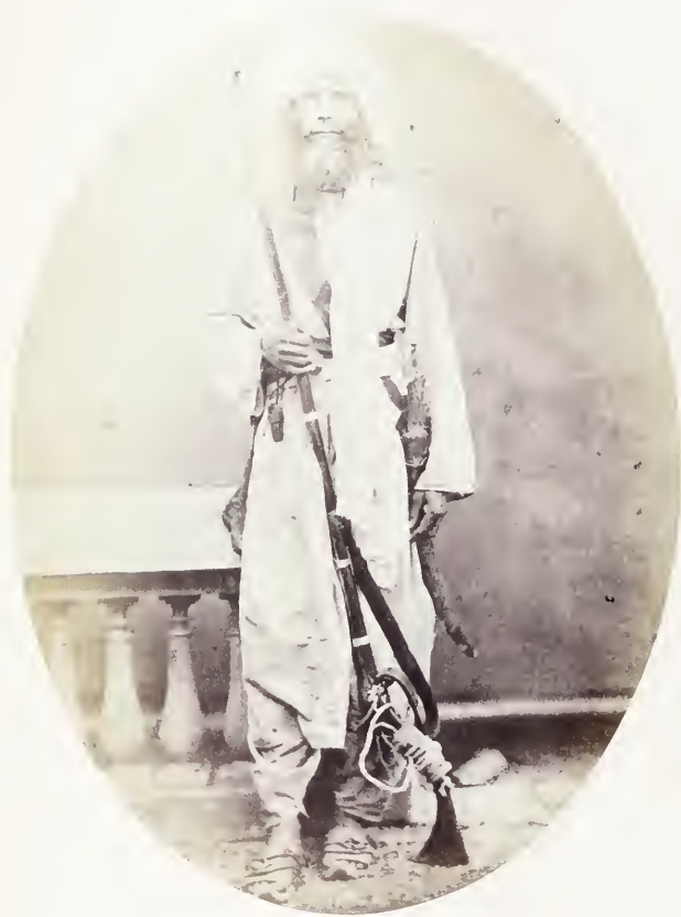
GABOLE. BELOCH MILITARY TRIBE. SOONNEE MUSSULMAN. SIND. 308.