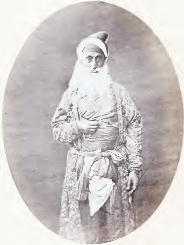
SIKH AKALI FROM THE PUNJAB SIKH SIND.