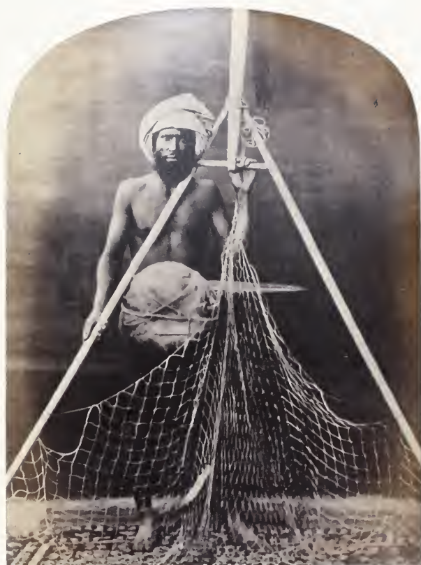
MOHANA FISHERMAN. SOONNEE MUSSULMAN. SIND. (337-2)