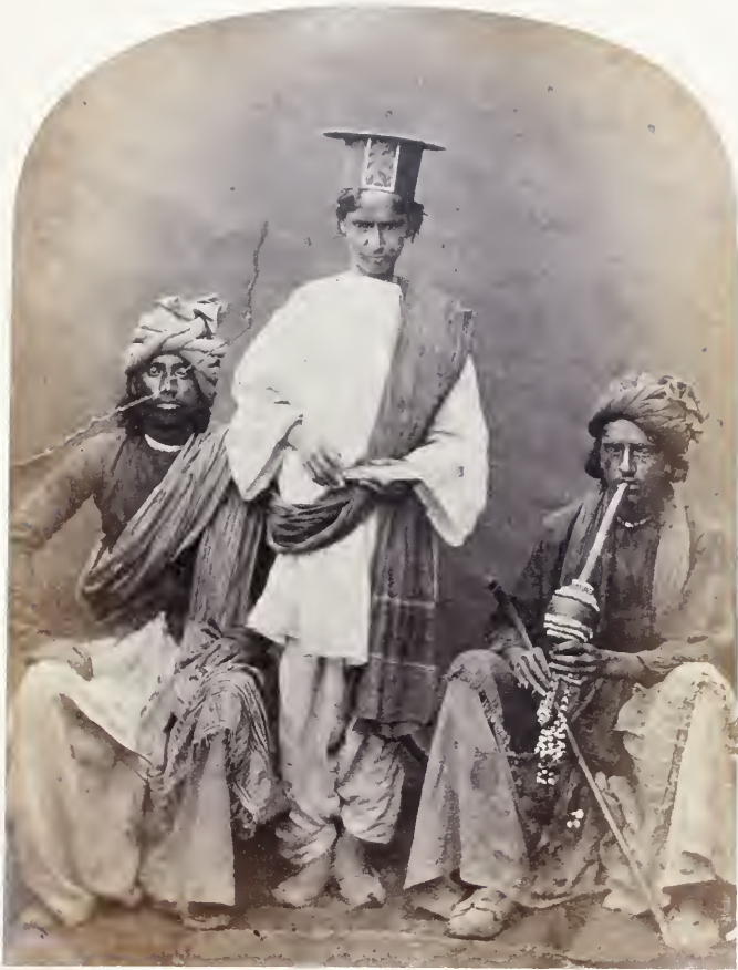
LANGHANS. MINSTRELS. SOONNEE MUSSULMANS. SIND. 335.