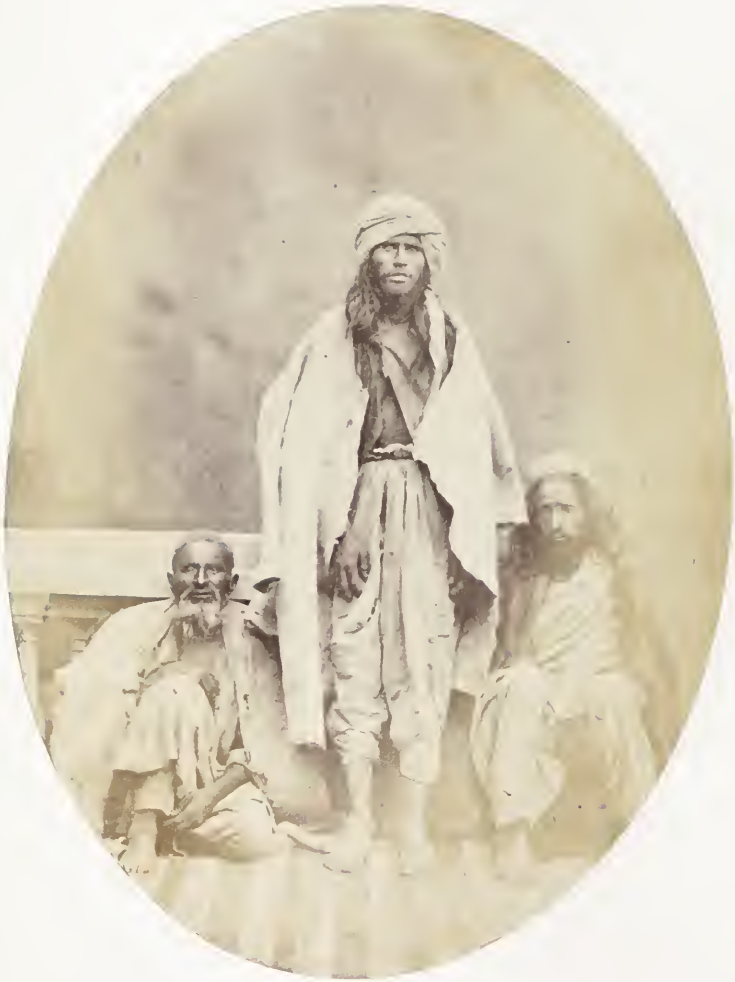
BRAHOOEES. UNARMED. INHABITANTS OF KHELAT STATE. SOONNEE MAHOMEDANS. SIND. 321-2.