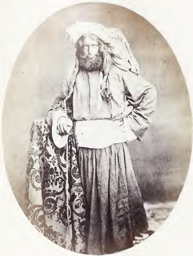
A GUDDRA. FROM LUS BEYLA. SOONNEE MUSSULMAN. SIND. 309.