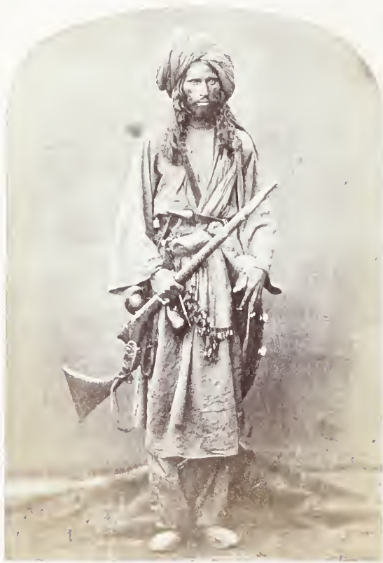
A KHOSA BELOCH FRONTIER TRIBE. SOONNEE MUSSULMAN. SIND.