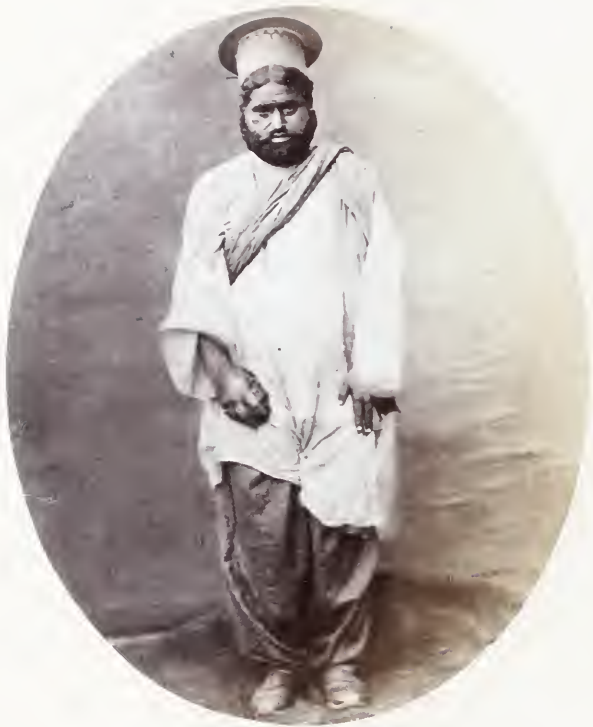
A NAREJA ANCIENT SINDEE TRIBE. SOONNEE MUSSULMAN. SIND. 314.