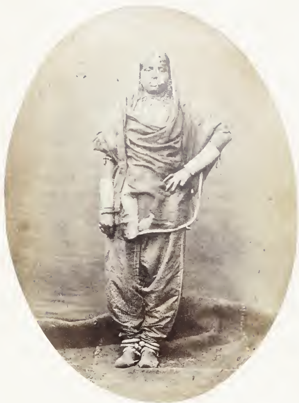
DANCING GIRL. HINDOO. SIND. 340.