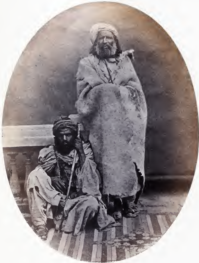
BHOOGTEES. BELOCH FRONTIER TRIBE. SOONNEE MUSSULMANS. SIND.