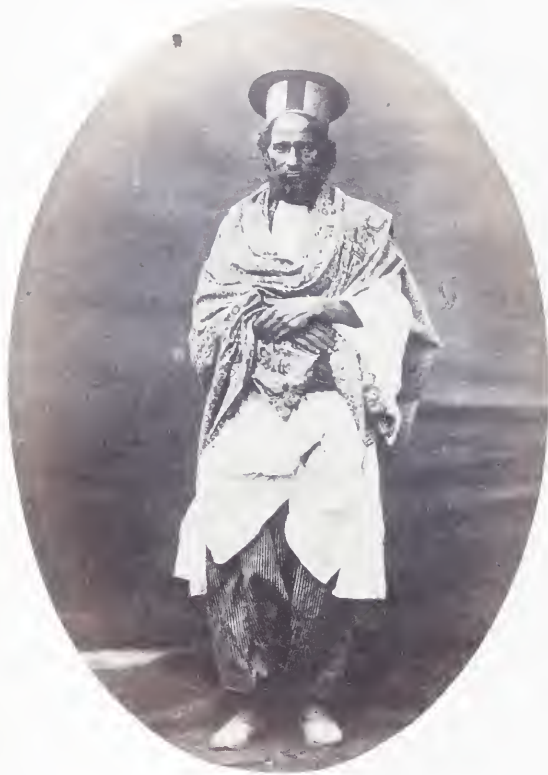
A PONHAR. ANCIENT SINDEE TRIBE. SOONNEE MUSSULMAN.