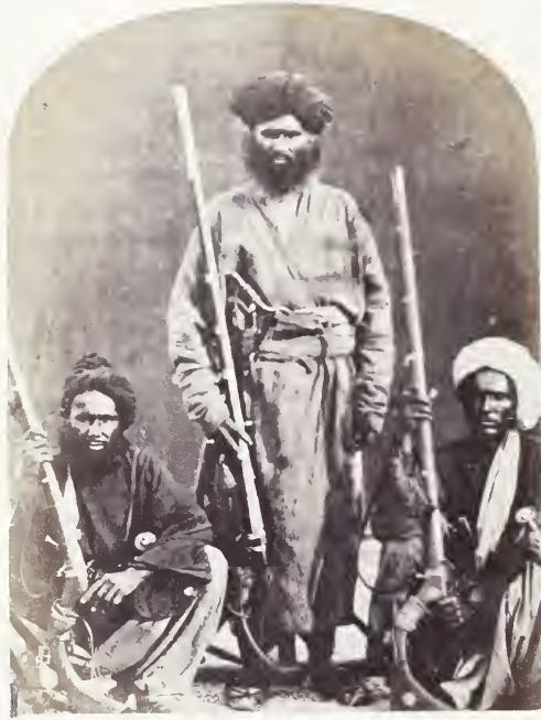
JOKYAS. MUSSULMANS. SIND. 813.