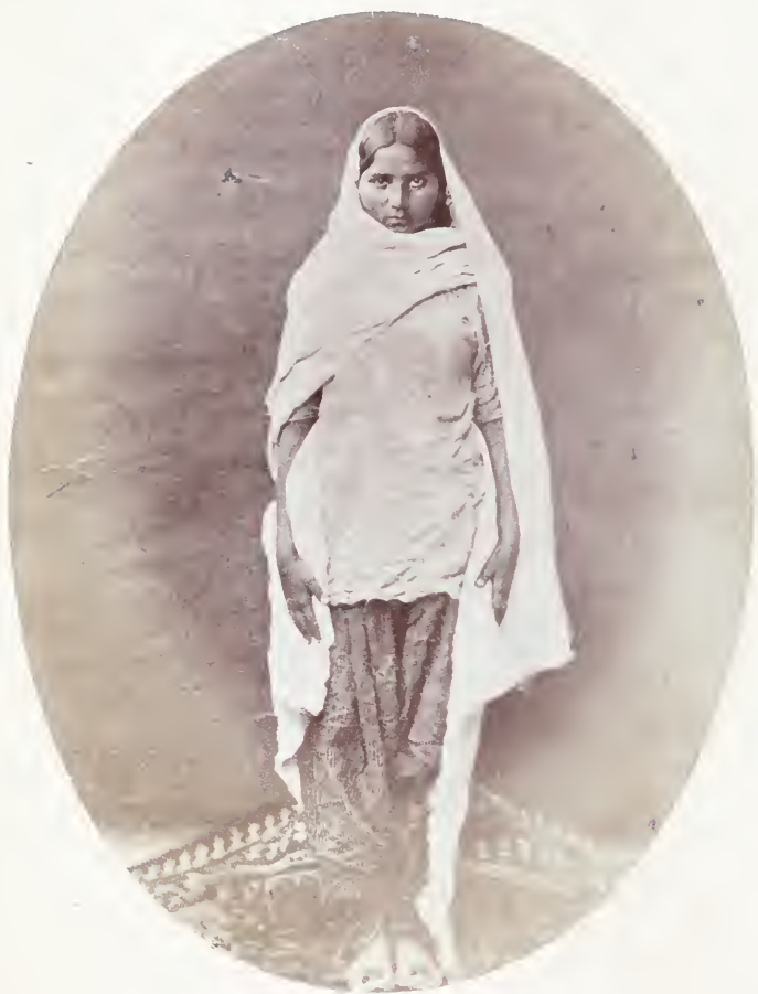
SINDEE WOMAN MUSSULMAN. SIND. 319.