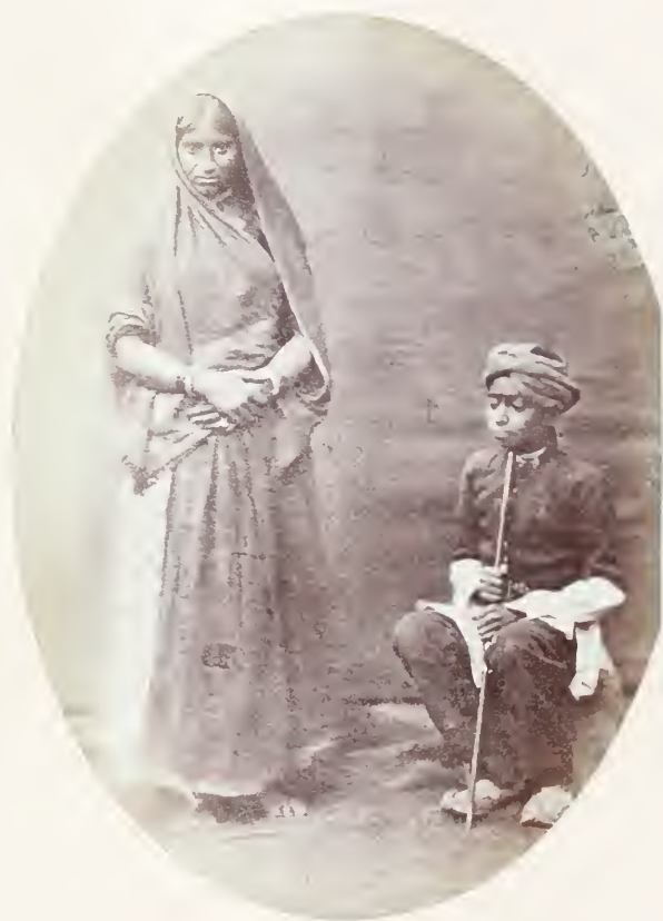
BABRAS. MERCHANT CLASS JAINS. SIND. 325.