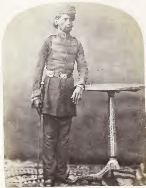
PRIVATE SECOND BELOCH REGT. SOONNEE MUSSULMAN. SIND. 328.