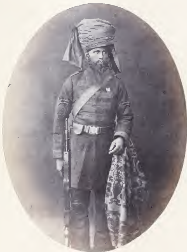
CORPORAL FIRST BELOCH REGT. RIND BELOCH. SOONNEE MUSSULMAN. SIND. 327.