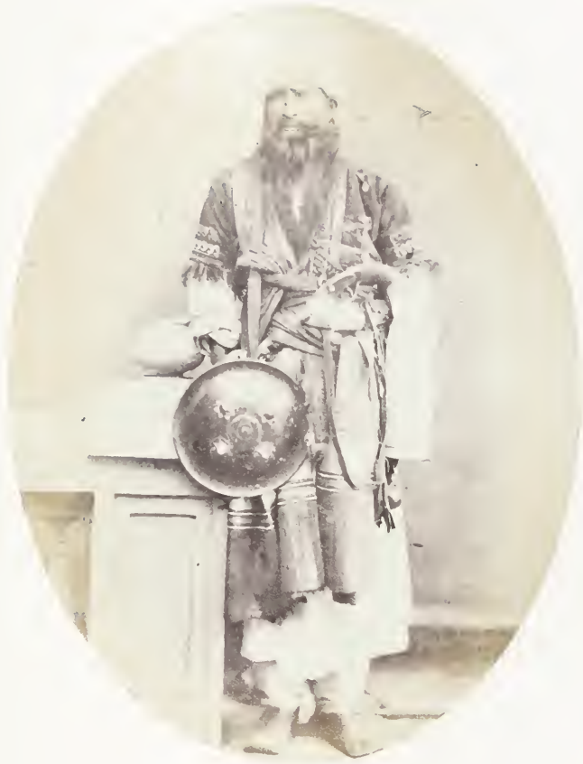
RIND. BELOCH TRIBE. SOONNEE MUSSULMAN. SIND. 298.