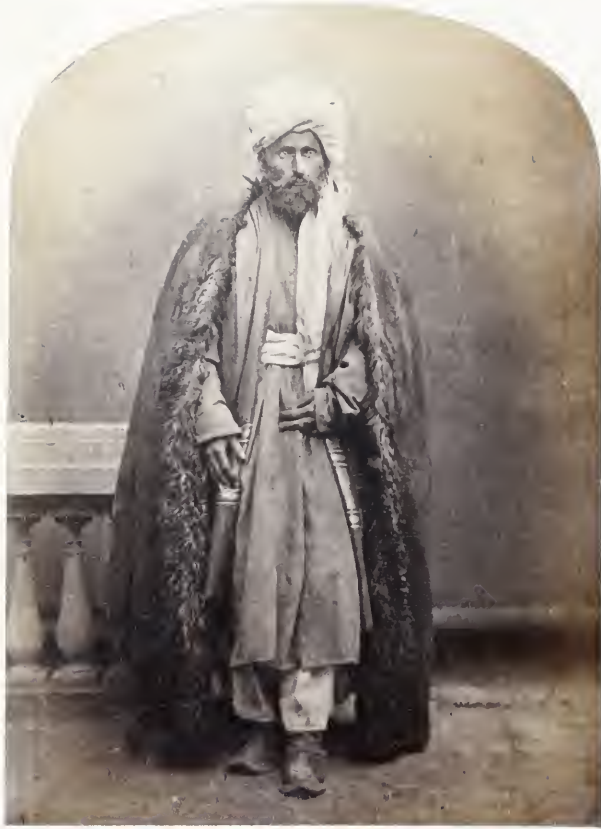
A KAKUR AFGHAN SOONNEE MUSSULMAN. SIND. 322.