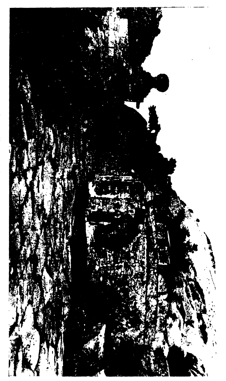
Ginzee: The Pondicherry Gate and the Royal Battery.