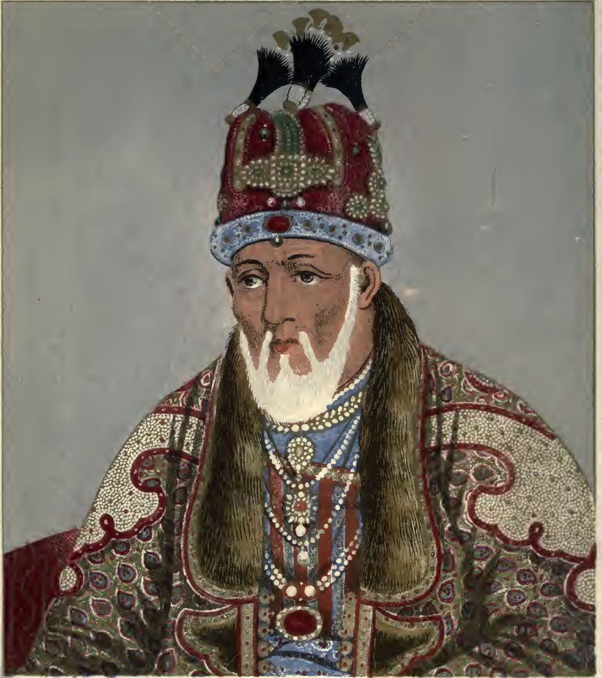
Day & Haghe Lith d to the Queen