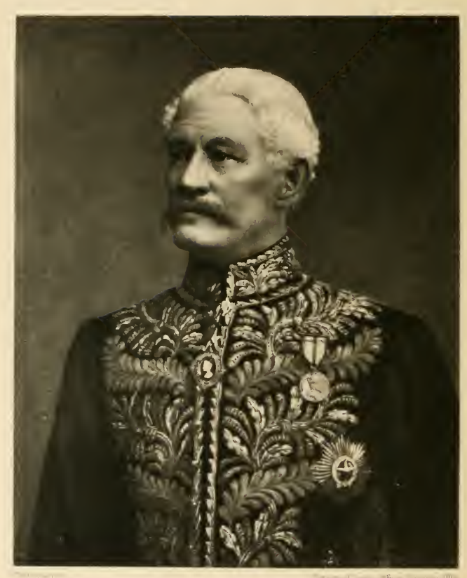
LET THE THIRT IN LIST CHAPTER, KIND