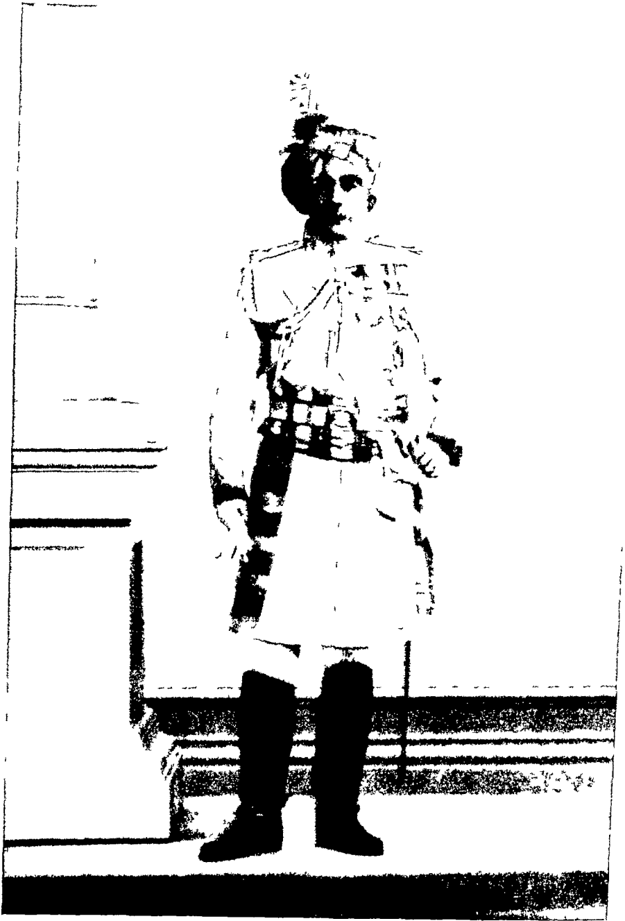
H H The Maharaja on his visit to London for the Coronation of H M King George VI, May 1957