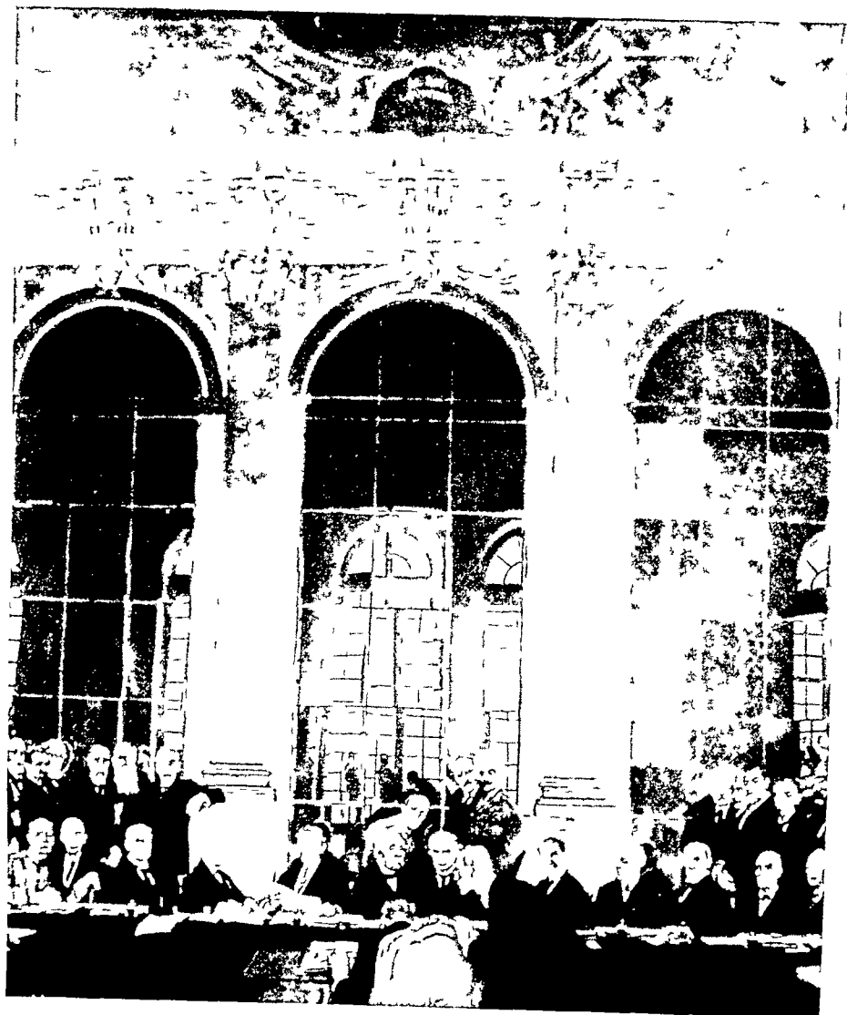
The Signing of Peace in the Hall of Mirrors, Versailles, June 28, 1919