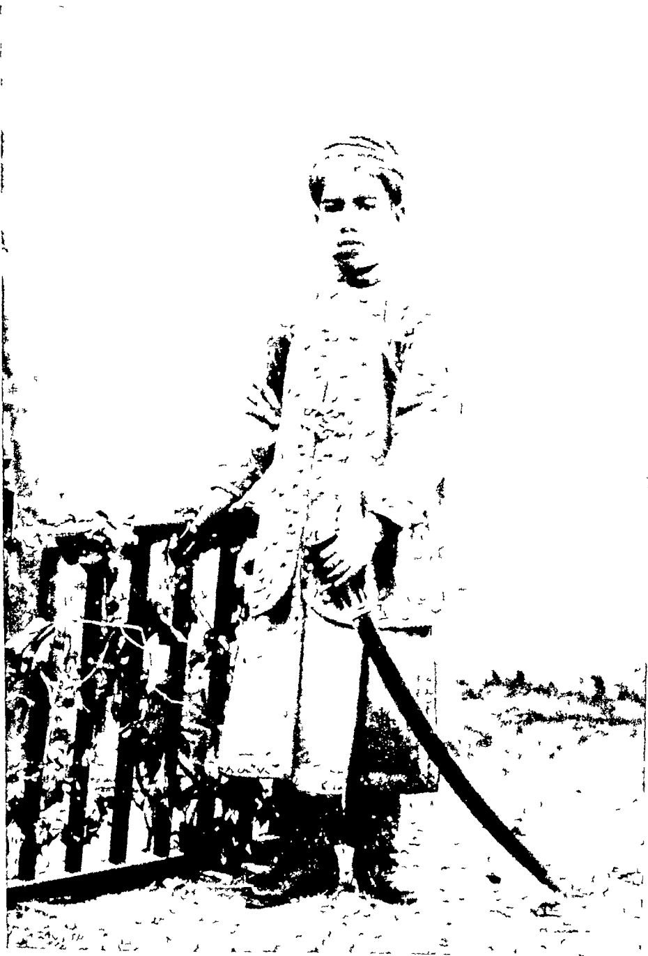
H H The Maharaja in his ninth year