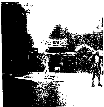
Site of the Lahore Gate